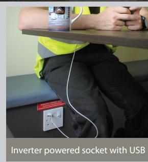
Inverter powered socket with USB