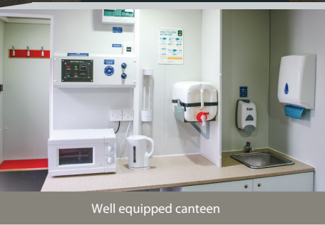
Well equipped canteen