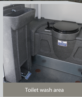
Toilet wash area

Innovative, functional, environmentally efficient and cost effective.